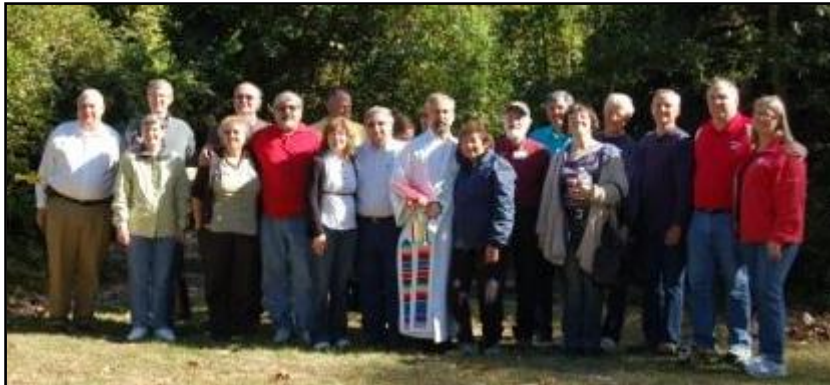
Above: Alumni and their families visit their old stomping grounds.

The Redemptorist religious order acquired the 110 acre property in 1956 from former Louisiana Governor Richard Leche. The main building was constructed in 1960. In September 1961 Holy Redeemer opened its doors to 55 young seminarians. The chapel (present Visitor Center) was opened in 1965. Due to a declining enrollment of seminarians the Redemptorists, in 1969, allowed non-seminarian "day students" from the