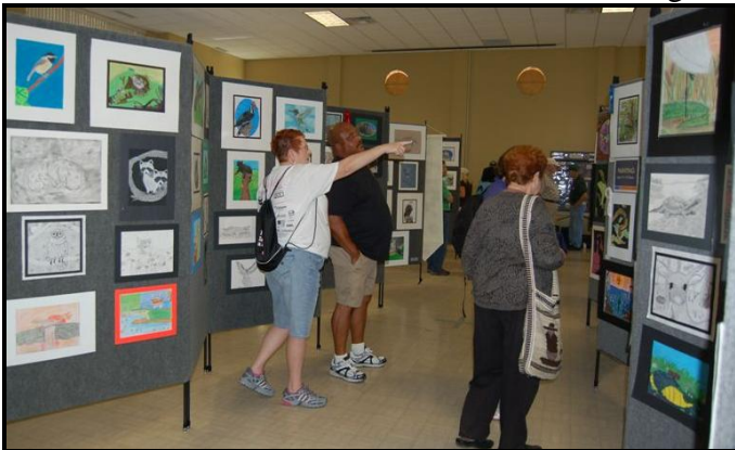
Wild Things visitors enjoy the art exhibition.